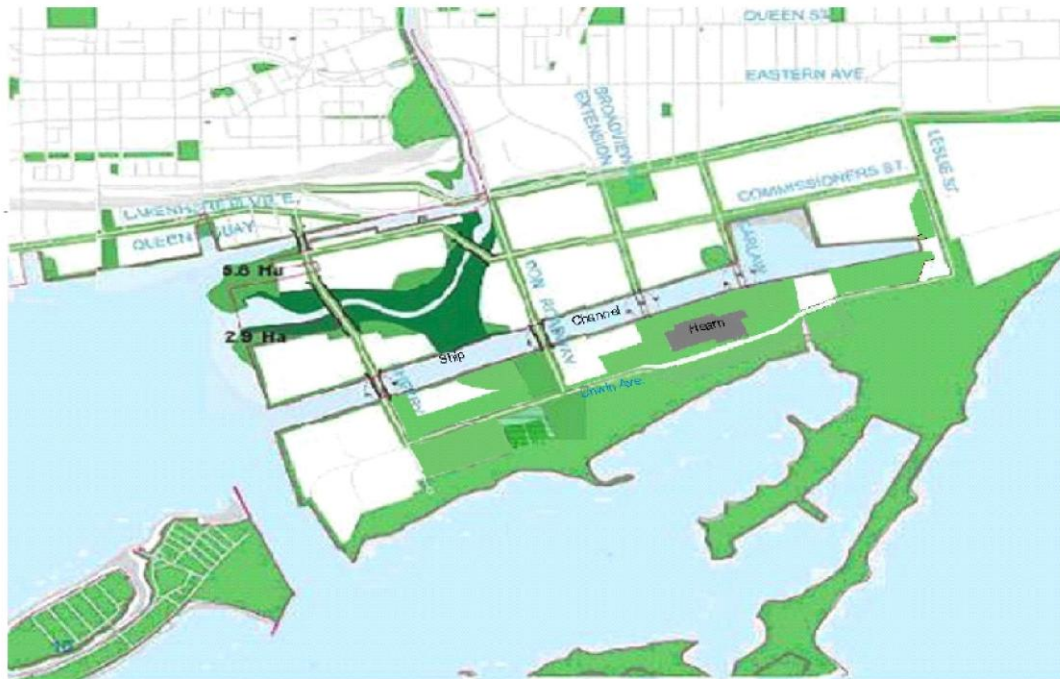
"PARKLAND IN THE PORT LANDS": This map has been prepared using the Port Lands Acceleration Initiative mapping in order to illustrate the parkland imperative for all lands south of the Ship Channel.