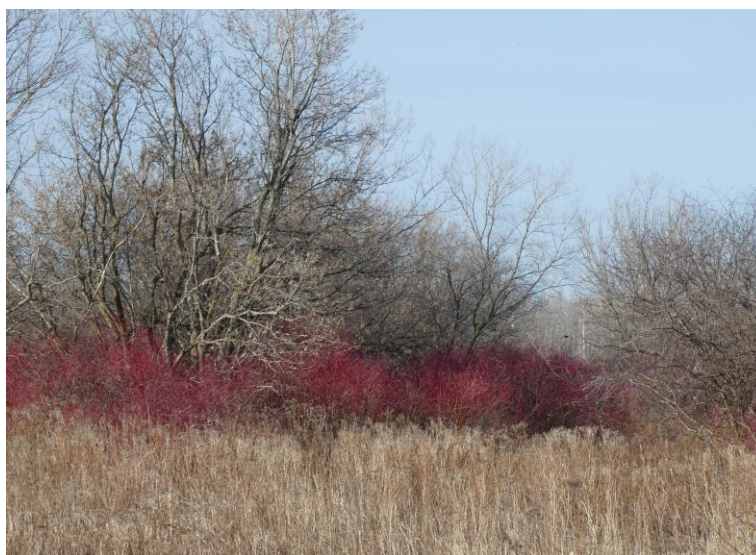
One harbinger of Spring.....

Nature is awakening after the long winter of snow, migratory birds are starting to appear in numbers, amphibians are awakening, and the roads are clear for hiking, walking and cycling. The best place in Toronto to get away from it all !